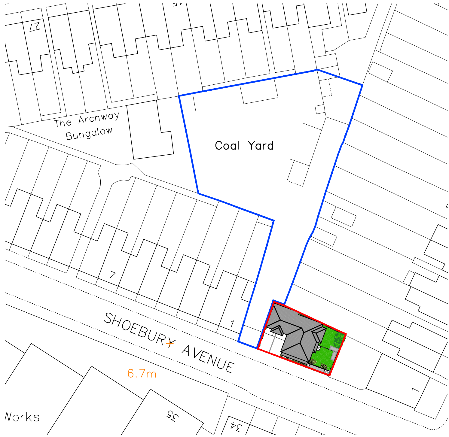
1 Site Plan