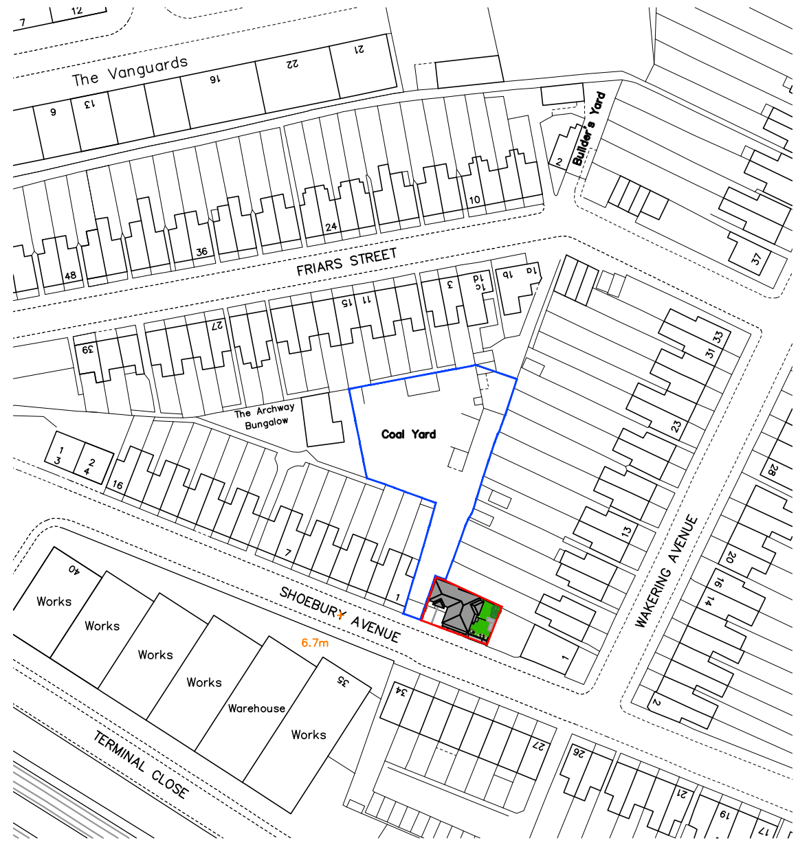
2 Location Plan

DO NOT SCALE THIS DRAWING. WORK TO FIGURED DIMENSIONS ONLY. THIS DRAWING IS COPYRIGHT OF APS DESIGNS AND SHOULD ONLY BE REPRODUCED WITH THEIR EXPRESS PERMISSION. CHECK ALL DIMENSIONS ON SITE. ANY DISCREPANCIES SHOULD BE REPORTED TO APS DESIGNS PRIOR TO COMMENCEMENT.